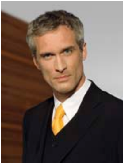
In dialogue with the customer – Business fashion comes in customized designs and universal lines.

boco and CWS provide well-experienced know-how in functionality and design as well as focused communication and contact with customers: to know what our customers like, to know what they need. boco and CWS ensure your working world is a comfortable one. boco and CWS offer more.