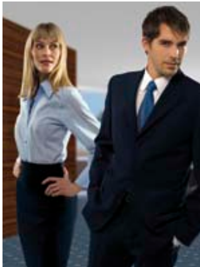
Ranging from suits to accessories and shirts, boco is high profile Business fashion.